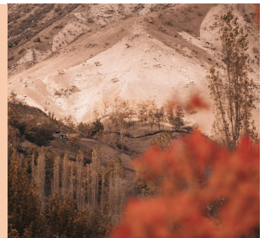
Mountains of Tajikistan